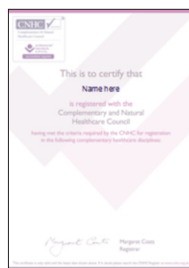
CNHC registration certificate

For full details about My CNHC and CNHC Resources go to the 'Current Registrants' page on our website or click here: My CNHC information